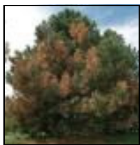
Pine Tip Blight

However, a browning pine does not necessarily mean the tree has Pine Wilt disease. Tip Blight and Needle Blight are two diseases that primarily affect Austrian, White and Mugo Pines. These diseases also cause browning in Pines. Unlike the deadly Pine Wilt, there are treatments available.